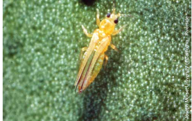
Adult California citrus thrips

Check your orchard frequently for the presence of new pests and unusual symptoms. Make sure you are familiar with common citrus pests so you can tell if you see something different.