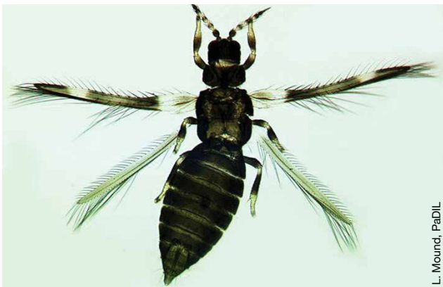
Adult bean thrips

If you see anything unusual, call the Exotic Plant Pest Hotline