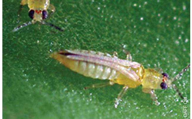
Adult South African citrus thrips

Exotic thrips species all differ slightly in appearance but all are tiny (about 1 mm in length) and have four wings (adults), with the front wings typically fringed and folded back over the body when at rest. Immature thrips resemble adults but are typically smaller, wingless and yellow or orange in colour. Adult thrips can retain the yellow or orange colouration (such as Florida flower thrips, blossom thrips, California citrus thrips and South African citrus thrips), although they often develop some darker markings or transition to a dark greyish-black or brown colour (such as bean thrips).