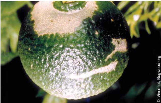
Blemishing on rind of fruit caused by South African citrus thrips

Of particular concern to citrus are the exotic bean thrips ( Caliothrips fasciatus ), Florida flower thrips ( Frankliniella bispinosa ), blossom thrips ( F. insularis ) and California citrus thrips ( Scirtothrips citri ). Although South African citrus thrips ( S. aurantii ) is present in Australia, in Queensland, this particular biotype does not appear to have a strong preference for citrus, and therefore it is likely there are more damaging biotypes not present in Australia that pose a serious risk to citrus.